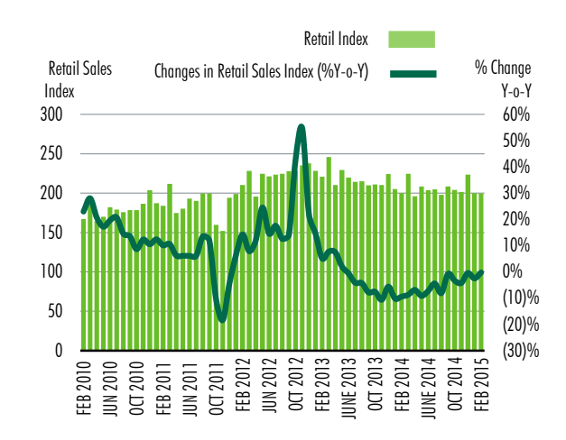
Figure 1: Thailand's Retail Sales Index

Competition in Bangkok is going to grow with the completion of new large scale shopping centres. New developments are going to put pressure on older developments especially if total spending power does not significantly increase. New shopping centres cannibalize customers from existing shopping centres so not every new mall will be a winner and some older malls will suffer.